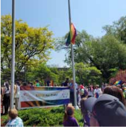
Raising the Pride Flag at YRDSB on June 1, 2023

Calling all Retired Teachers and families!