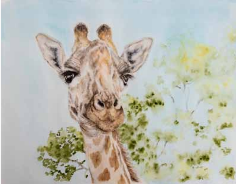
Why, Hello There A Watercolour

Kate's favorite subjects to paint are flora, fauna, and landscapes, where she tends to work representationally; in glass, she leans more to abstract expression or thematically linked pieces. Most recently she is experimenting with collage, and adding dimensional pieces to her paintings. Her works range from decorative paintings, glass panels, and pet portraits, to more practical items such as garden stepping stones and fused glass votive candle pieces.