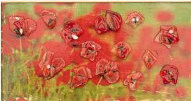
Remembering Fused Glass, Phototransfer

In her work, light and transparency are key. She is fascinated by the way watercolour and glass can carry literal and metaphoric weight in their ability to be transparent, translucent or opaque, allowing us to consider what we can see through, see beyond to, or not see. In watercolour she plays with additive layers of delicate hues to create form and meaning, whereas cutting, fusing, layering, and juxtaposing glass and the mixed media components of her artwork give her a more tactile method of sharing her ideas.