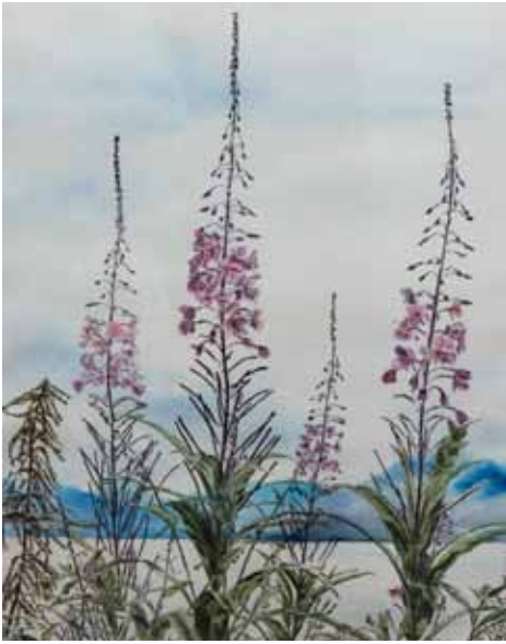
Alaskan Fireweed A Watercolour