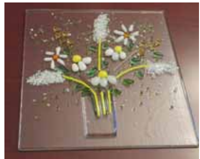
A Summer Bouquet Fused Glass