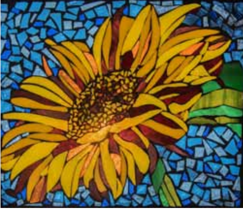
A Sunflower For Ukraine 2 A Glass on Glass Mosaic