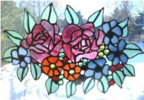
The Brooch Traditional Stained Glass